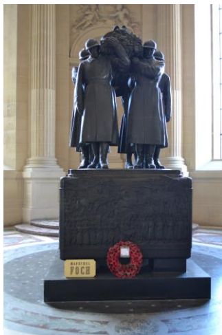
Tomb of Marshall Foch